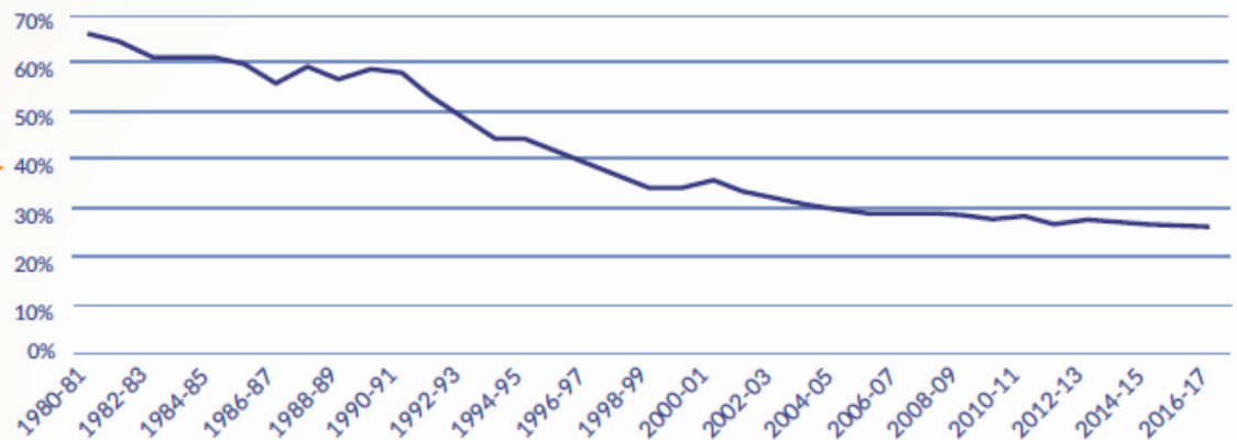
Reimbursement Rates 1980 - 2017

Reimbursement rates have fallen from a high of 70% in 1980 to the new low of 24.5% in 2018-2019.